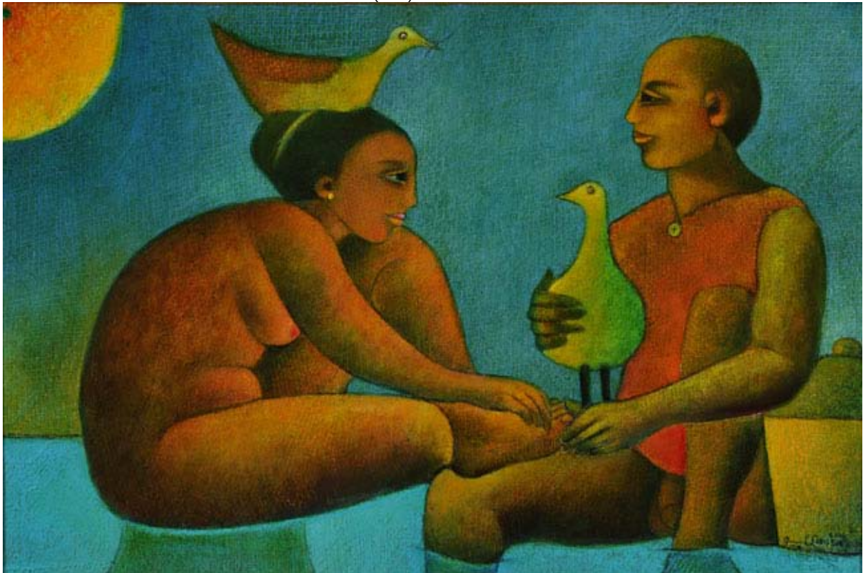
Omar d'Leon, "Tropicana", oil on canvas, 24"x36", 2007